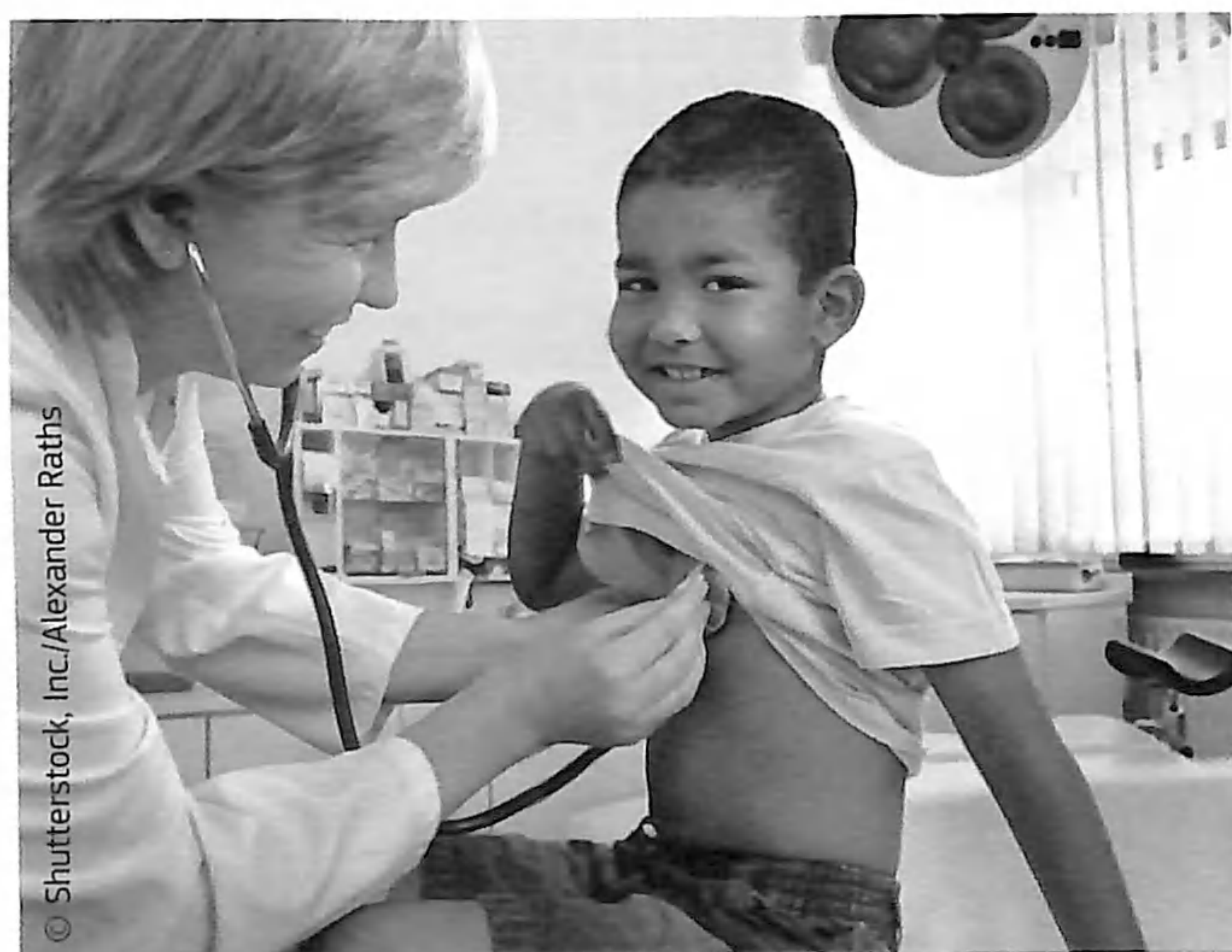
The EU seeks to improve the quality of healthcare for all its citizens.

While the organisation and delivery of healthcare is the responsibility of individual countries, the EU brings added value in helping countries achieve common objectives. EU health policy generates economies of scale by pooling resources, and helps countries to tackle the common challenges, including health threats such as pandemics, the risk factors associated with chronic diseases or the impact of increased life expectancy on healthcare systems.