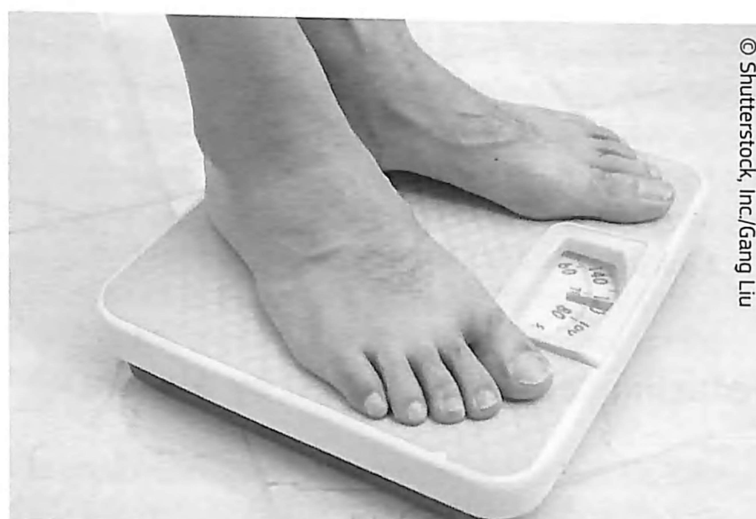
The EU is working with organisations across Europe to tackle the problems associated with poor diet and obesity.

The EU has also — between 2005 and 2013 — run a series of pan-European awareness-raising campaigns aimed at reducing smoking. The first — 'HELP — for a life without tobacco' — targeted 15 to 25-year-olds by means of a multimedia campaign. This was followed by the 'Ex-smokers are unstoppable' campaign which focuses on smokers in the 25 to 34 age range. This campaign urges people to quit smoking by promoting the benefits to be gained by doing so, and provides practical help with quitting via iCoach, an innovative digital health platform.