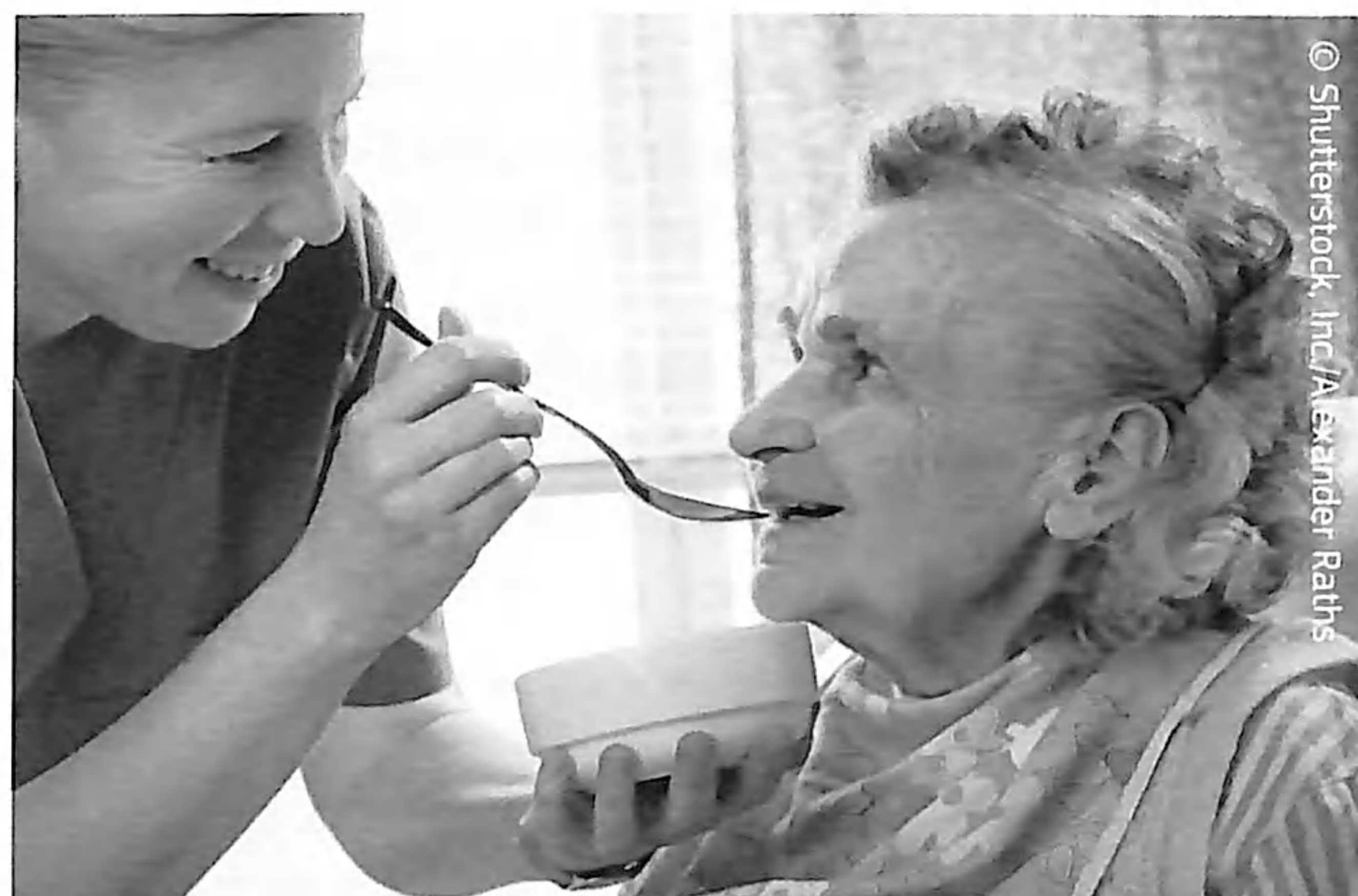
As Europeans live longer, the problems associated with dementia are increasing.

This initiative was implemented through the Alcove joint action, which brought together 19 EU countries to exchange good practices and formulate policy recommendations; and through the joint programme 'Neurodegenerative disorders', the largest global research initiative aimed at tackling the challenge of such diseases.