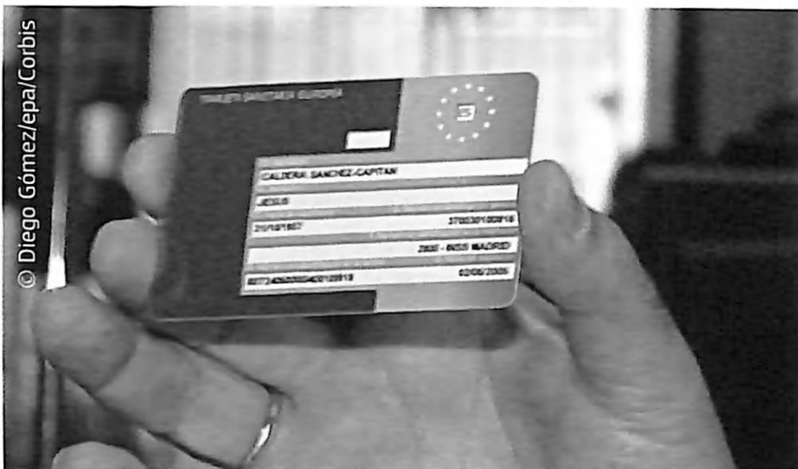
The European Health Insurance Card gives you access to medical treatment and care across Europe.

A national contact point has been set up in each EU country to provide information to patients on their rights and on quality and safety issues.