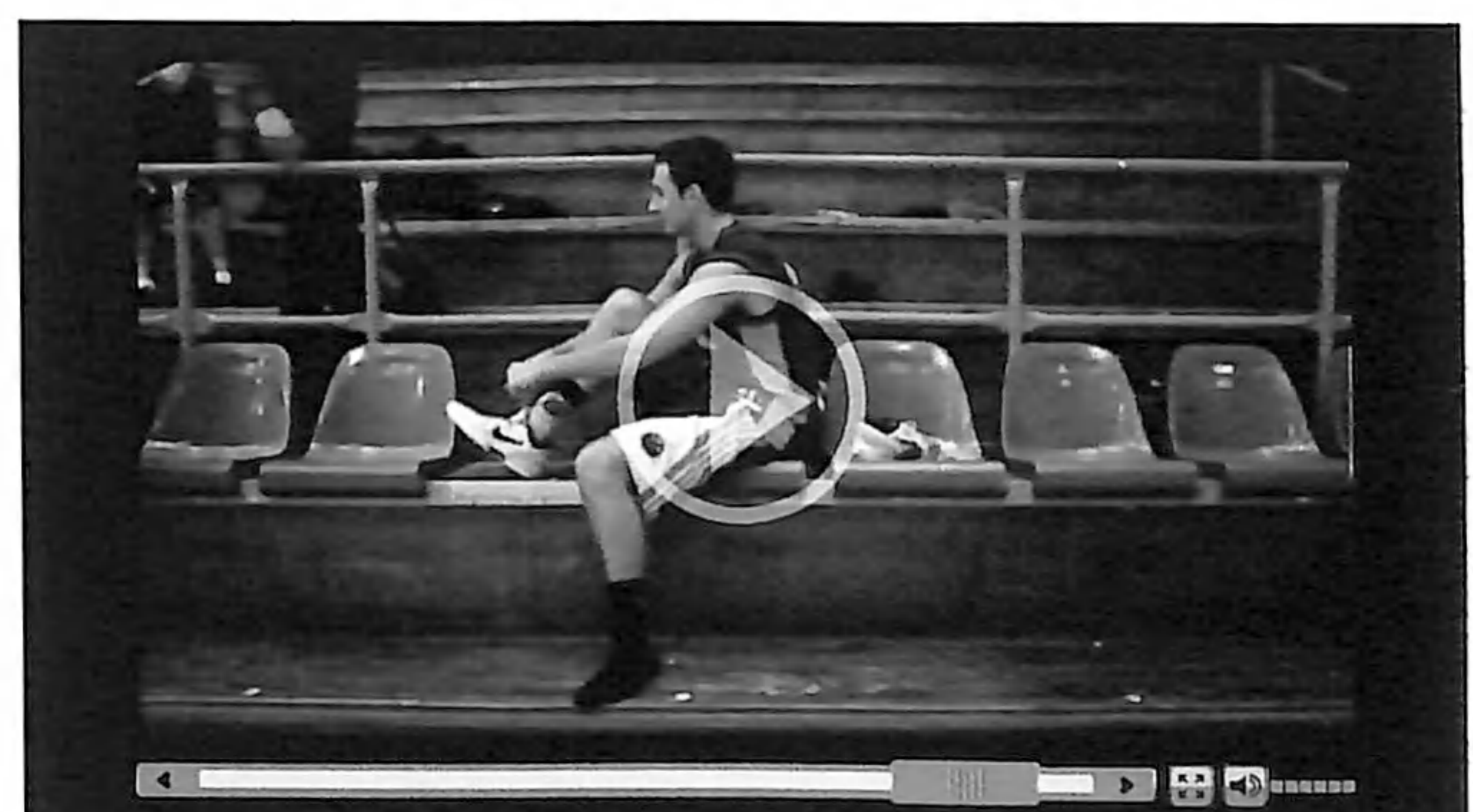
Towards a smoke-free life.

A central pillar of tobacco control is EU legislation on tobacco products. Over the years this has led to the